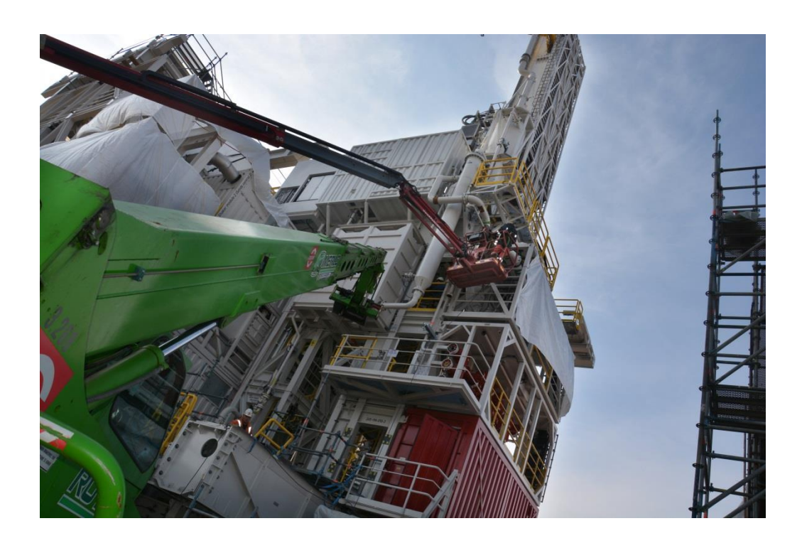
Fig. 4: Installation work on the VDD 400.2 offshore deep drilling rig

The gas production in the Heimdal gas field has fallen considerably in recent years. Today, the Heimdal platform primarily acts as a central junction in the North Sea for the processing and distribution of gas. The platform is supplied with gas from the Huldra, Oseberg, Skirne and Vale fields and routes it to the Norwegian mainland via the Vesterled Statpipe. At peak levels of gas extraction, the Heimdal platform is responsible for around 15-20% of all Norwegian gas production.