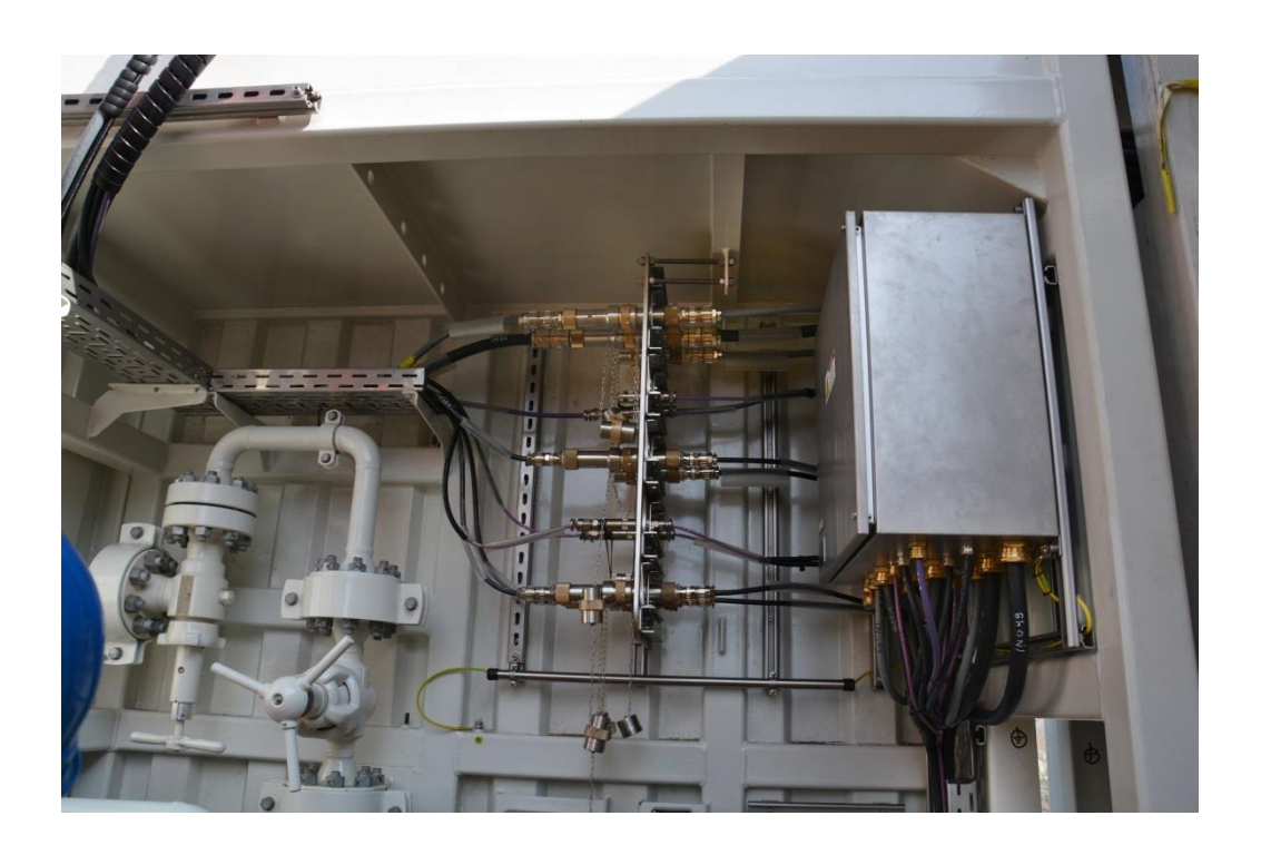
Fig. 3: HAWKE connectors (I) and HAWKE cable glands (r) in use – created for tough and potentially explosive environments.