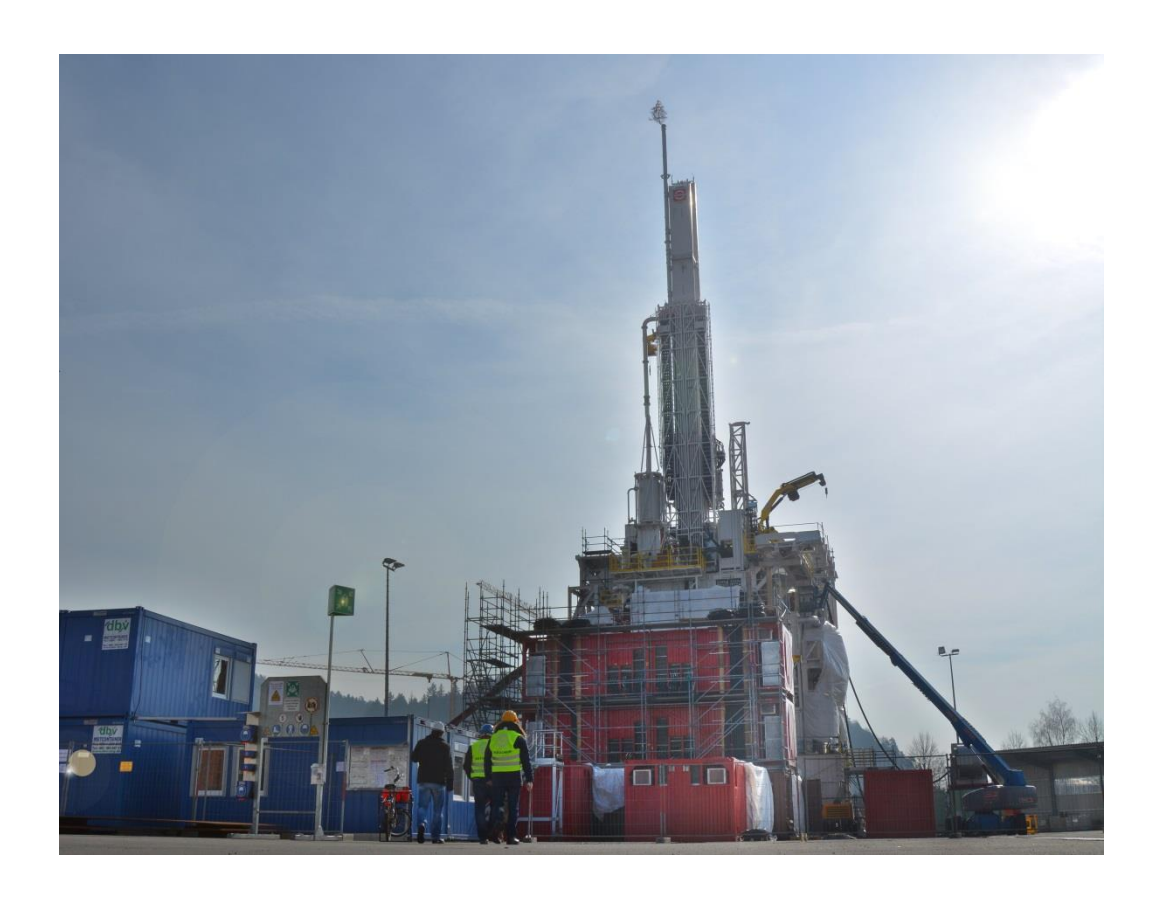
Fig. 1: It's not a UFO, it's the VDD 400.2 offshore deep drilling rig from MAX STREICHER GmbH & Co. KG. in Deggendorf, Lower Bavaria.