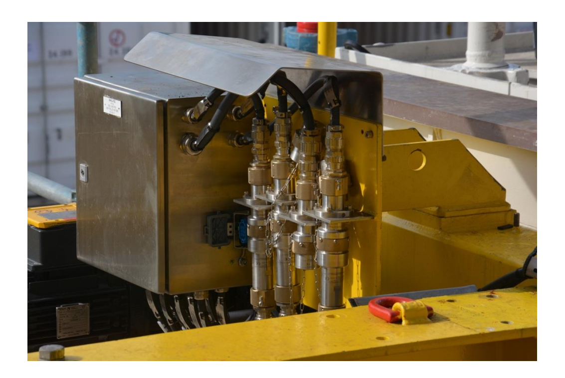
Fig. 2: HAWKE connectors make the modular concept of the VDD 400.2 offshore deep drilling rig a reality.

impossible to make any progress using the standard jack-up platforms." There are two potential solutions.