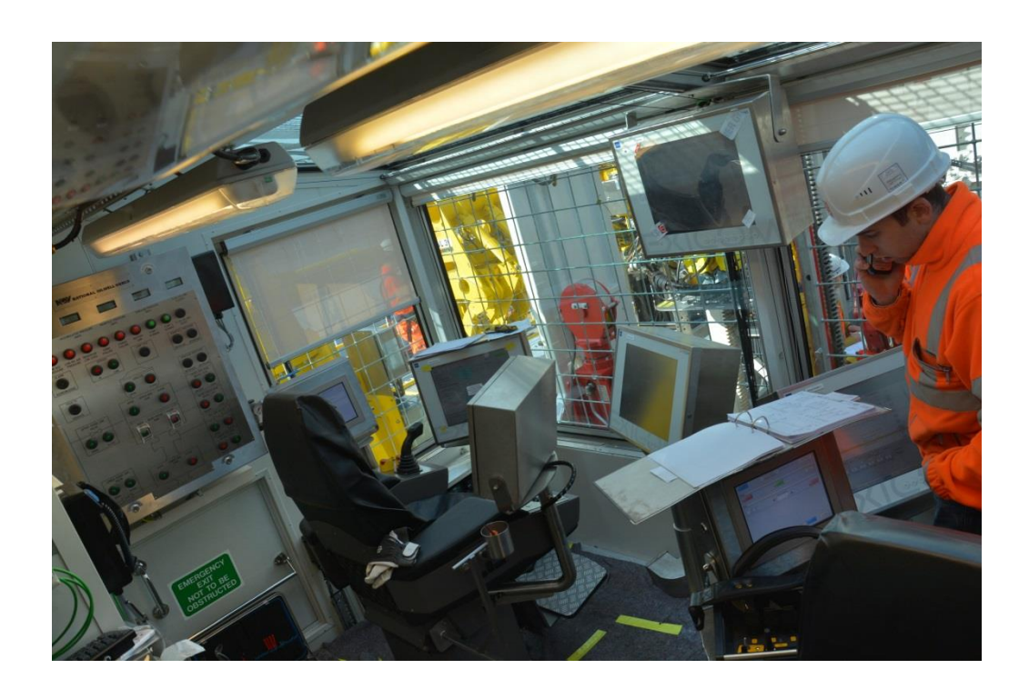
Fig. 6: The control centre of the VDD 400.2 offshore deep drilling rig